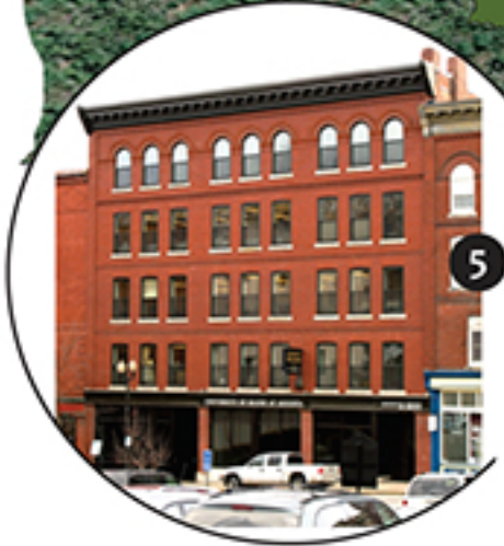
5 Gannett Building on Water Street in downtown Augusta: home to Architecture, Art and Women Work and Community